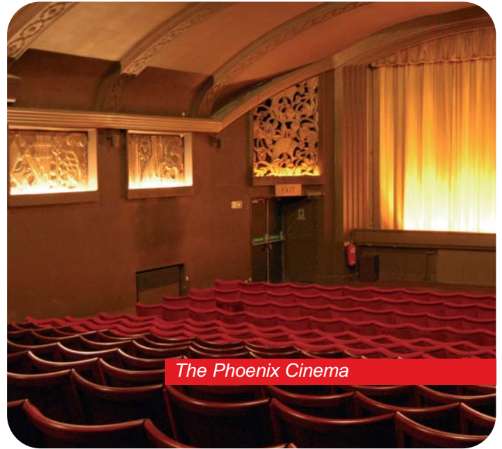
The Phoenix Cinema

To get back to Highgate Tube from Muswell Hill take a leisurely 25-minute stroll down Muswell Hill Road past or through Highgate Wood. Or a 12-minute bus ride on the 43 or 134.